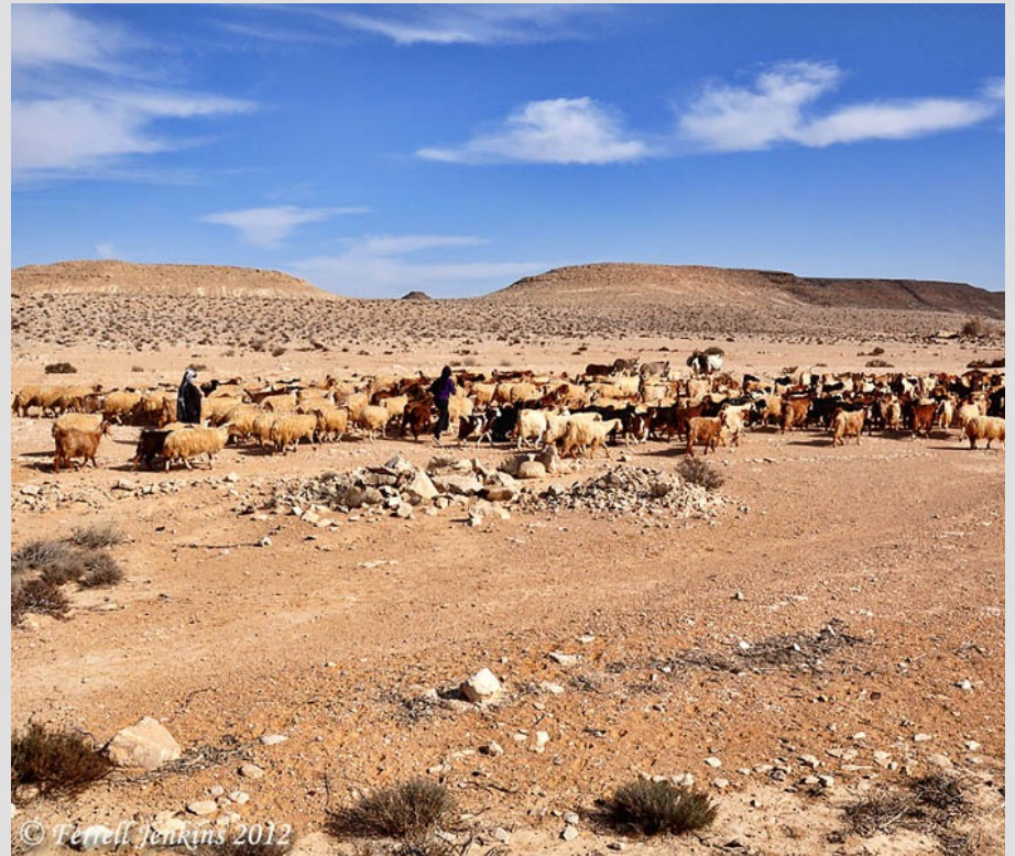
Shepherds in the Wilderness of Zin