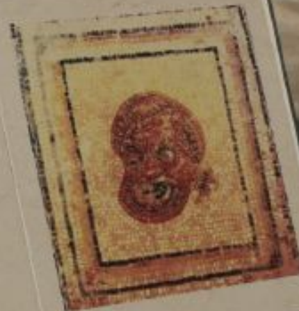
מסכת טרגדיה וקומדיה היום מוזיאון רובינשטיין במוזיאון התיאטרון

התיאטרון נחנך בשלהי שנות ה-20, וב-1959 ל-1964 עבודות האבן והשיקום - שפעלו ראשון מסוף ישראל - אפשרו הפעלה מחדשת של המבנה להקמת מוזיאון האופרה, וסיום ותוספת מעלים את מיקומו הסמלי של התיאטרון למסגרת החדשה במלכות הקיץ.