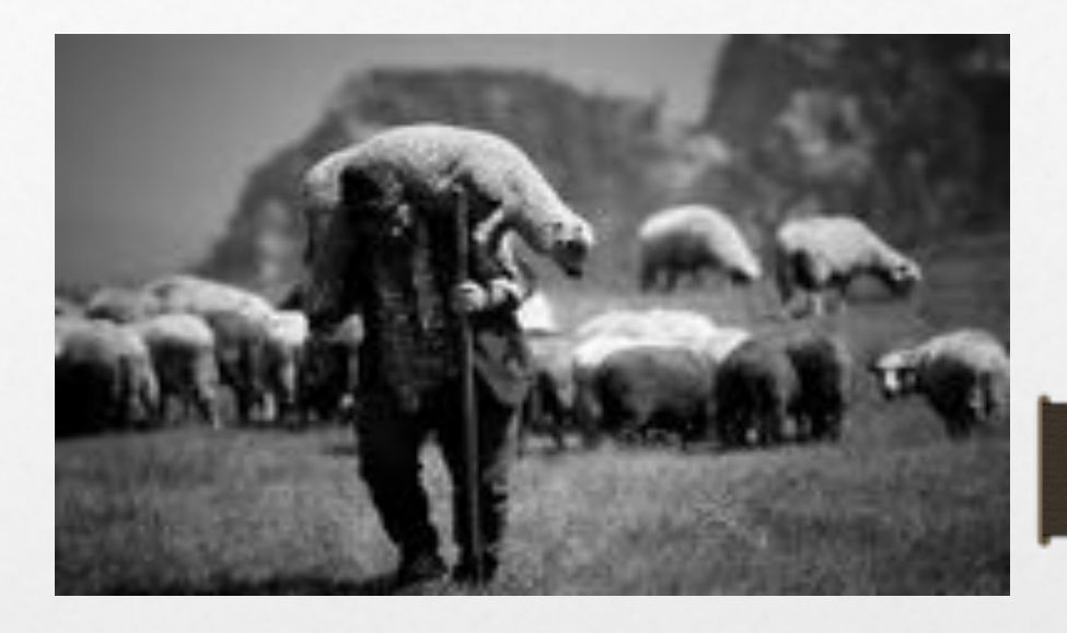
Donkeys and Shepherds Zechariah II